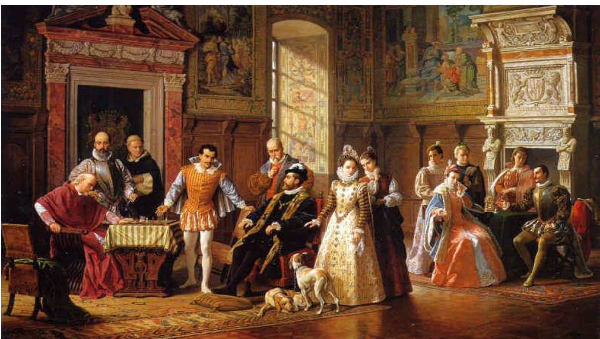
Partita a scacchi tra Ruy Lopez e Leonardo da Cutro alla Corte di Spagna

https://www.chess.com/blog/kurtgodden/ruy-loacuteppez-on-the-ruy-loacuteppez