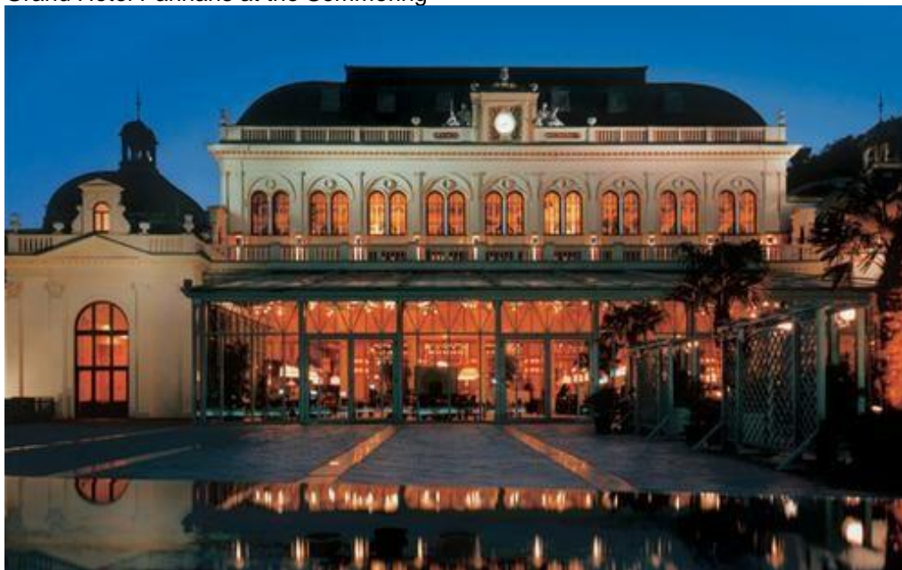
Casino of Baden bei Wien in modern times